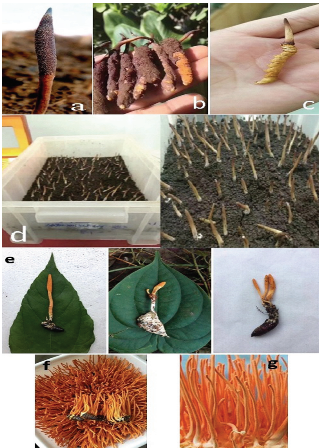
Medicinally important Cordyceps species: (a) Cordyceps sinensis mature fruiting body in the wild, (b) C. sinensis dug out from soil, (c) dry C. sinensis product, (d) artificial Ophiocordyceps sinensis on living caterpillars, (e) Cordyceps militaris growing in the wild, (f) artificial C. militaris growing on insects, (g) artificial Cordyceps militaris growing on a culture medium.

militaris cultivation has been further advanced, resulting in a high yield of stromata production and high content of Cordycepin [75,83]. C. militaris cultivation was also investigated using different media [84–86].