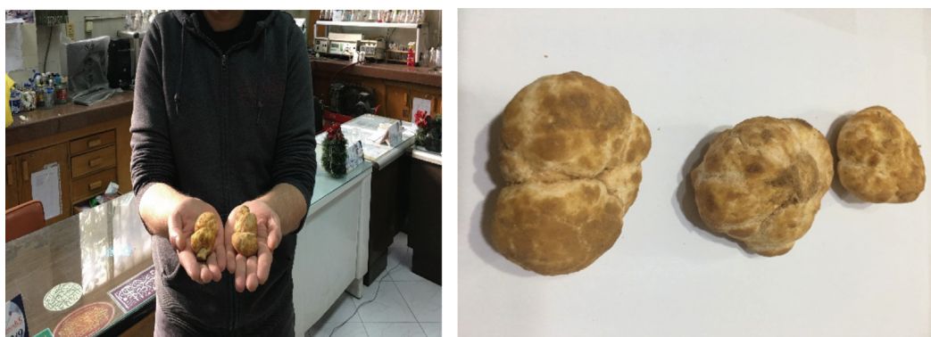
Truffles Ex. Tirmania spp.