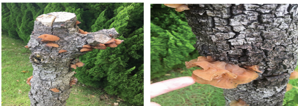
Jelly mushroom Auricularia spp.